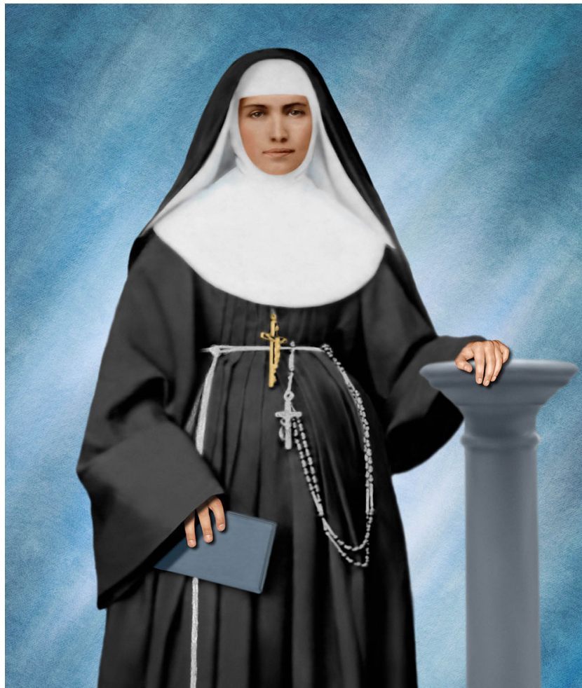
St. Marianne Cope 1838-1918