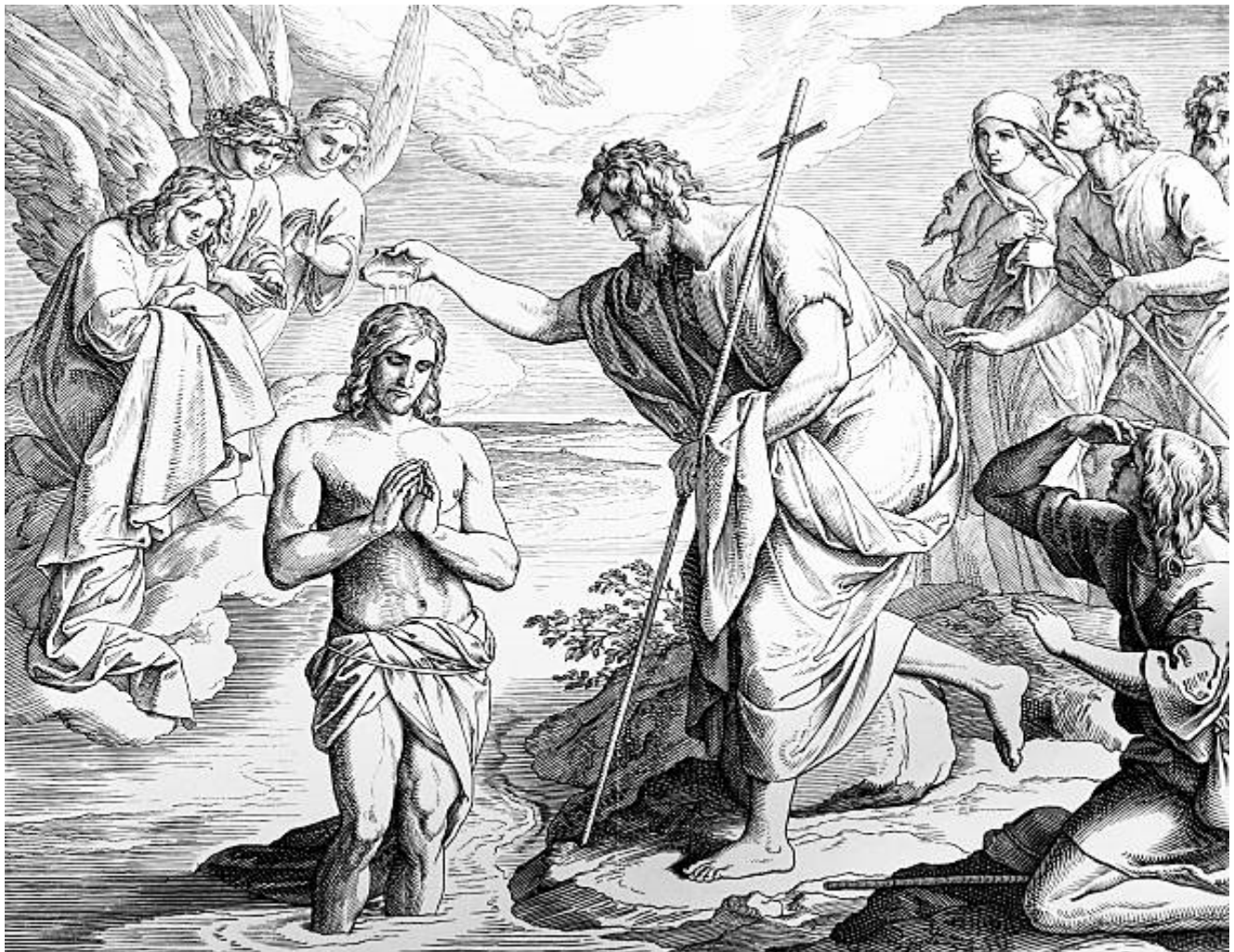
The Baptism of Our Lord