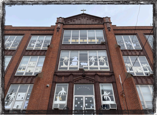
Santa kneels before the baby Jesus in this year's Christmas window display on the front side (middle window) of Holy Trinity School in Wallingford.

Just in time for the Wallingford Stroll in December, the eighth-grade students at Holy Trinity School in Wallingford completed their annual Christmas window display – to the delight of school neighbors and town residents.