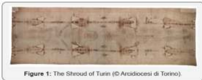
Figure 1: The Shroud of Turin.

The rally will begin at 12:00 p.m at the Capitol and the MARCH will begin at 1:00 p.m at Bushnell Park. More information will be provided in next week’s Parish bulletin regarding local transportation options, etc.